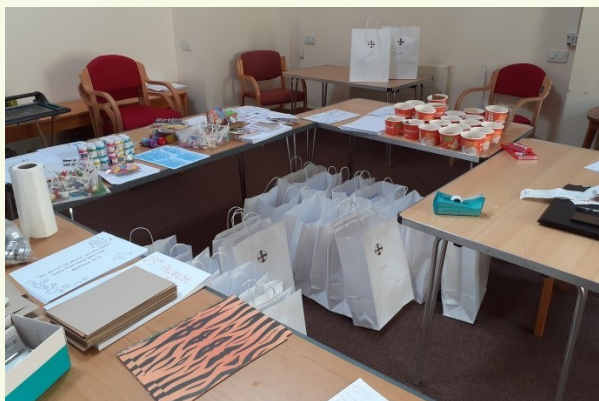
The "Assembly Line" – summer activities, craft, Bible stories, sweets and fun in a bag for our church families with young children.

It has enabled us to include different content and more people in so many ways. We miss the proximity and presence of gathered church, which remains essential, but there is still a form of both proximity and presence in our online connections.